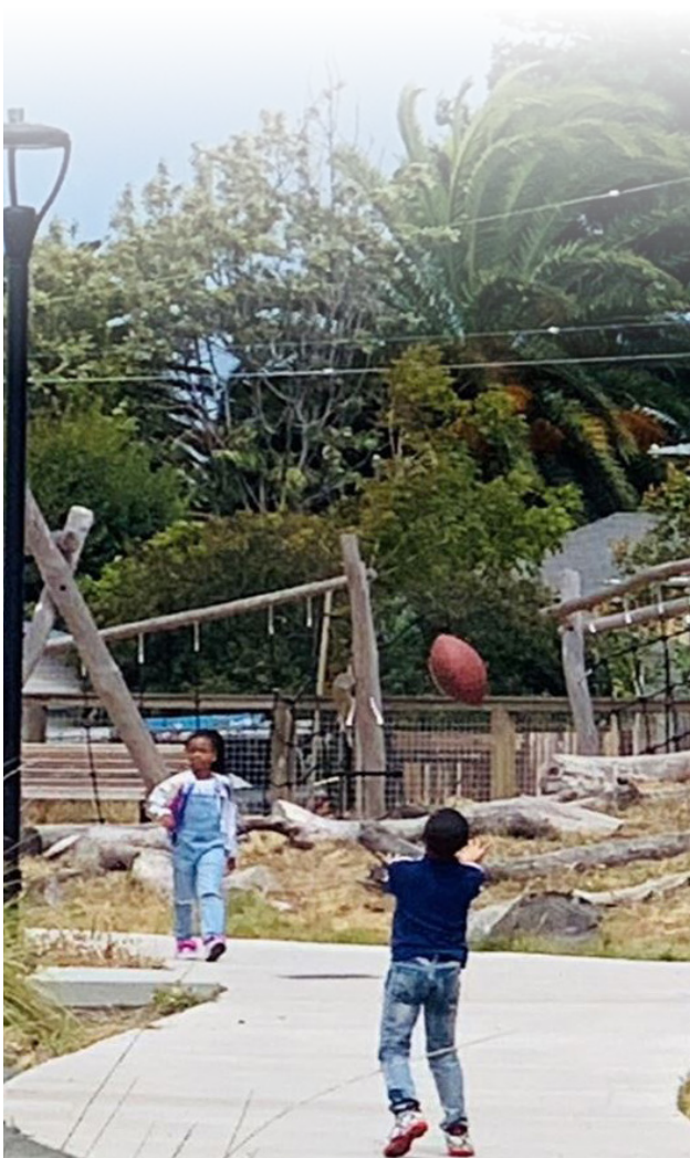
Placeholder Image. Descriptive caption is included here - Maybe RichCity Rides has some photo assets they can share?